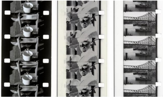
Reversal (camera original positive, solid black edge), Negative copy (clear edge), Print (clear edge or solid black edge depending on printing)