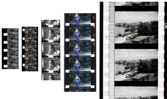
Common film gauges (left to right) standard 8mm, Super 8, 9.5mm, 16mm and 35mm

For over a hundred years, the motion picture film industry has created a legacy of different film gauges and film types, manufactured for both the domestic and professional markets. Personal and institutional film collections contain material in a range of conditions resulting from variables such as the original manufacturing and processing methods and materials, and storage and handling specifics. Understanding the effect these elements have on the physical and chemical properties of film is central to the long term preservation of motion picture film collections. This leaflet aims to provide general information for the care of film collections. For details on identification, deterioration, care and storage of specific film types, refer to the additional resources listed.