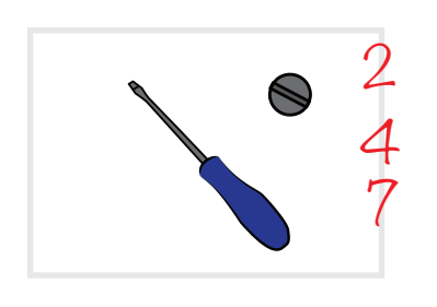
Screwdrivers - flat