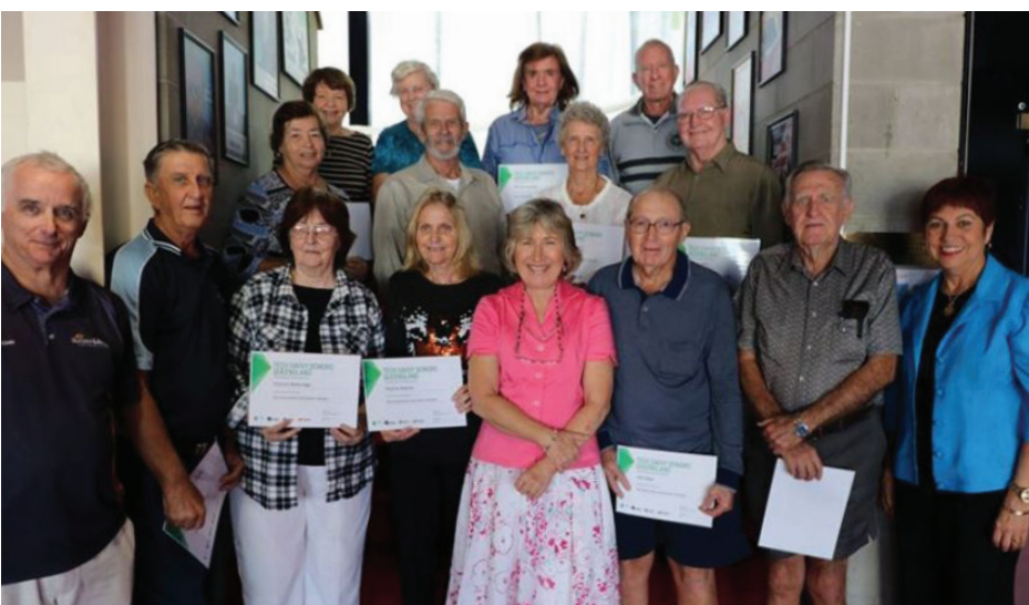
Burdekin Shire Tech Savvy Graduates

If you want to mention people by name or use their photo always get their advance written approval and let them know how the photo is going to be used (e.g. on social media sites like Facebook, in emails or in newsletters)