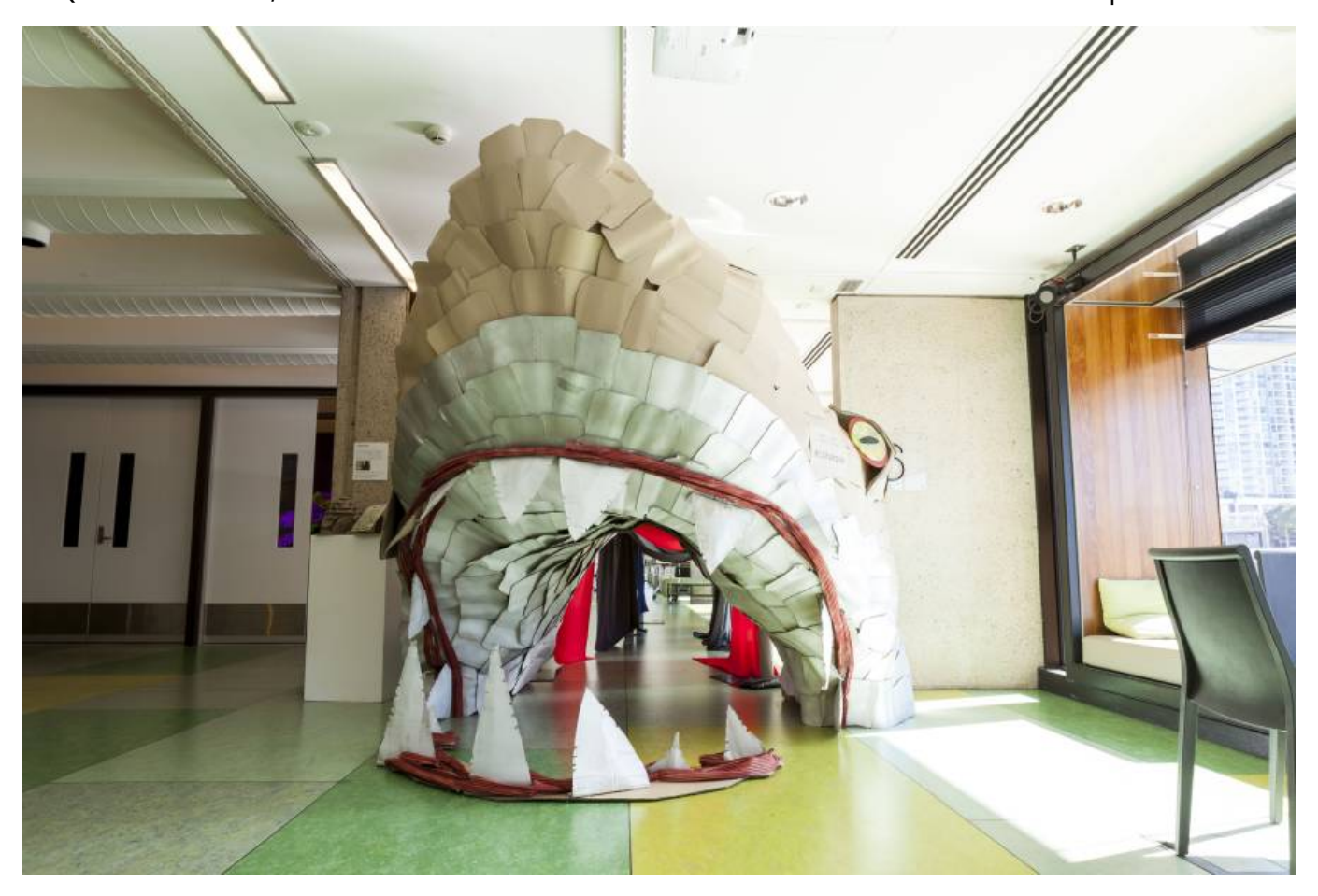
Story #1-5076 Plutoni-ants Nest

Shhh as you enter the nest of the ancient Plutoni-ants, a mysterious race known for their love of Maltesers and whispering sweet nothings. Every year, they host an intergalactic tongue twhipsers contest to find the sweetest, silliest sequences.