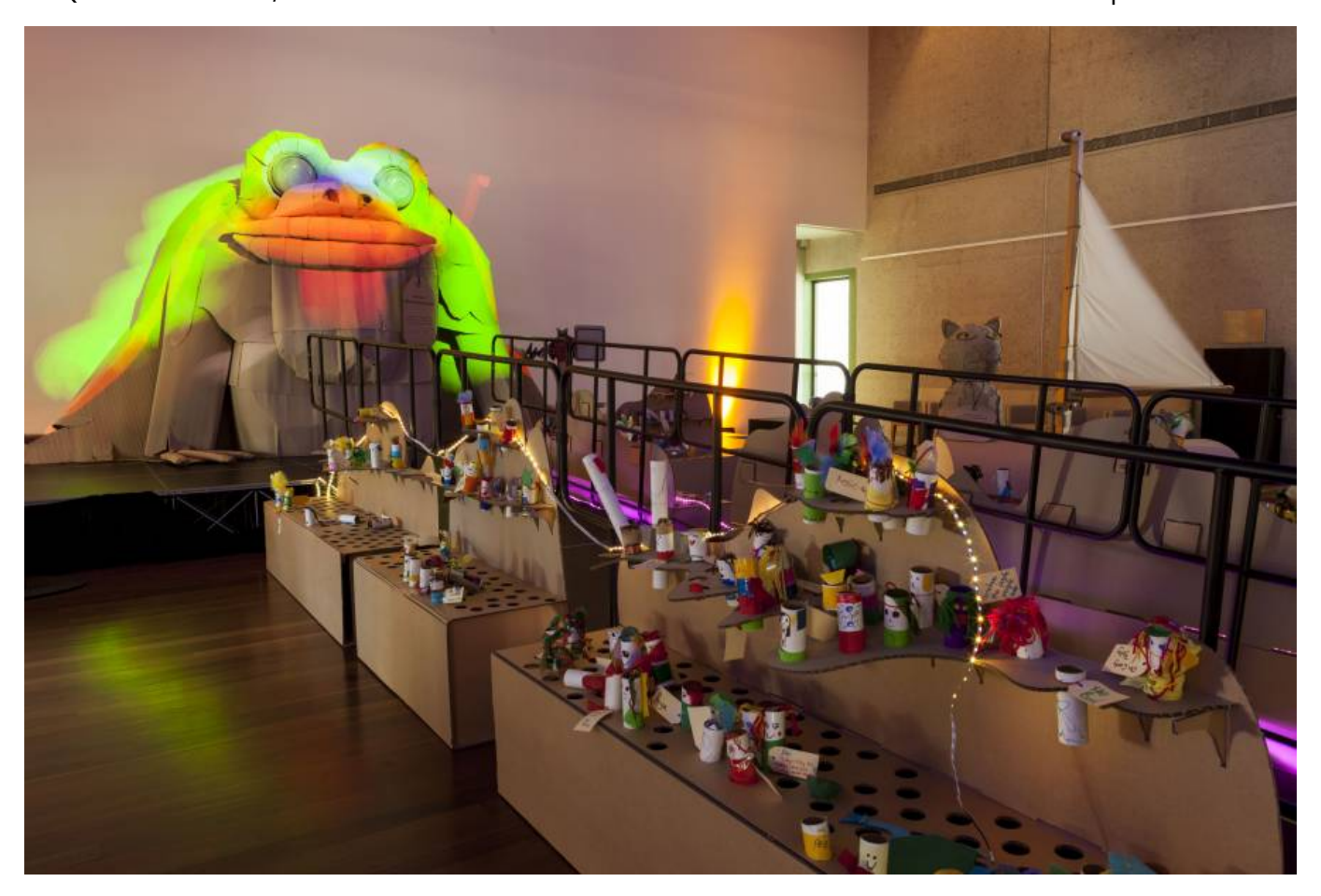
Story #9752 The Moon

Hello down there! It's me (up here). Yes me, the moon. I love to swing and spin and orbit. I love to float high up in the sky. What happens up here, you'd like to know? A big moon dance party. That's what.