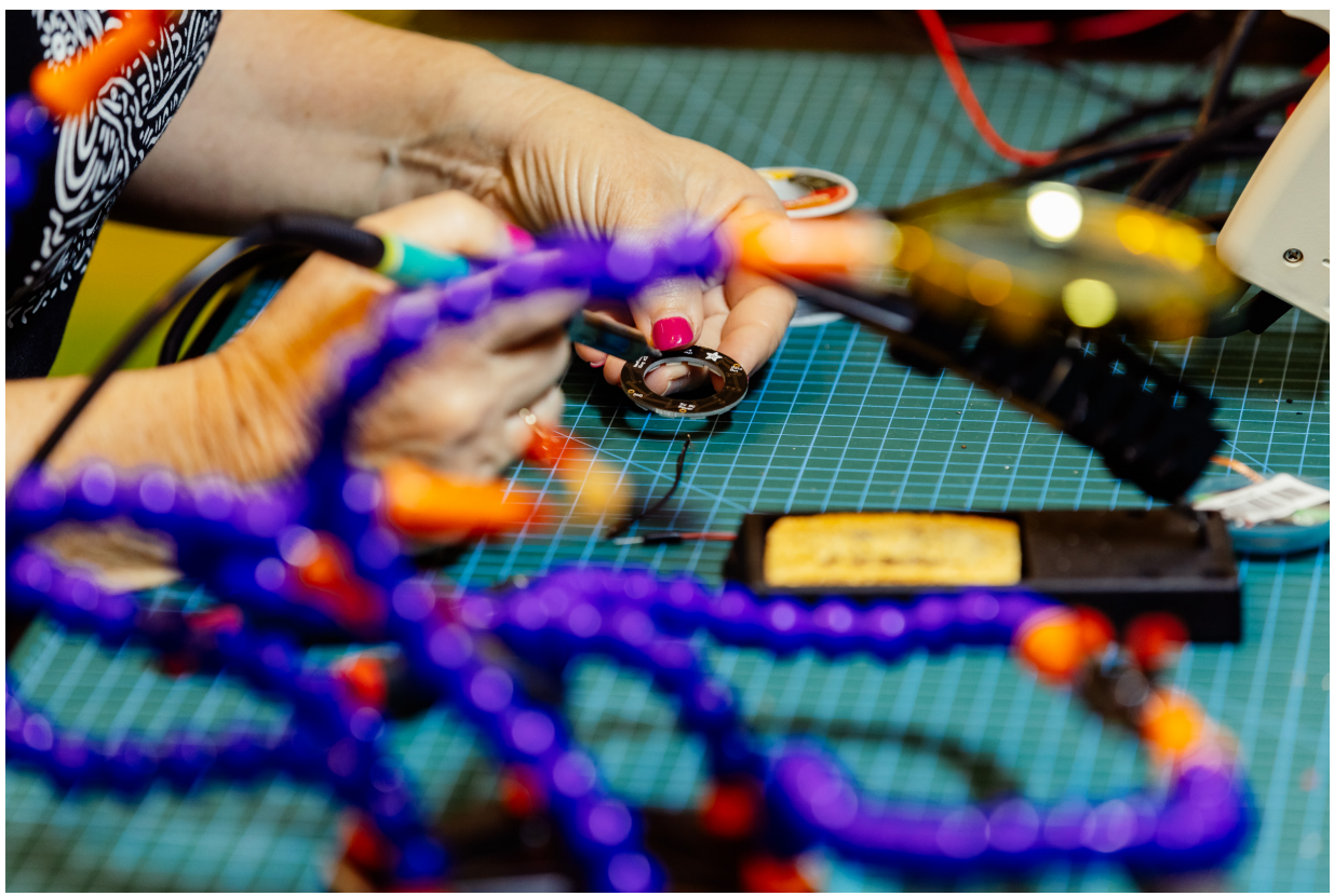
Open Lab Resources Here you will find resources to help you with your projects at our Open lab sessions.

For the latest information on access to The Edge always check the State Library Website