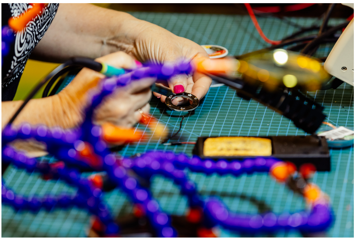
Open Lab Resources Here you will find resources to help you with your projects at our Open lab sessions.

For the latest information on access to The Edge always check the State Library Website