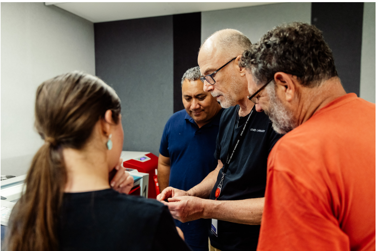
Inductions Here you will find info on our equipment inductions, including resource links.