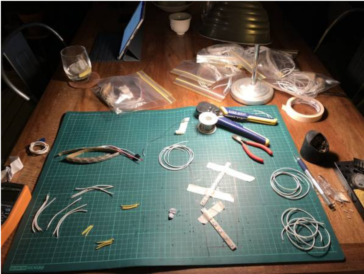
9. Tarzan grip and tape