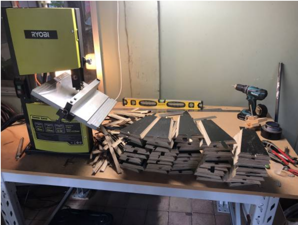
6. Trim put together and looking good in black