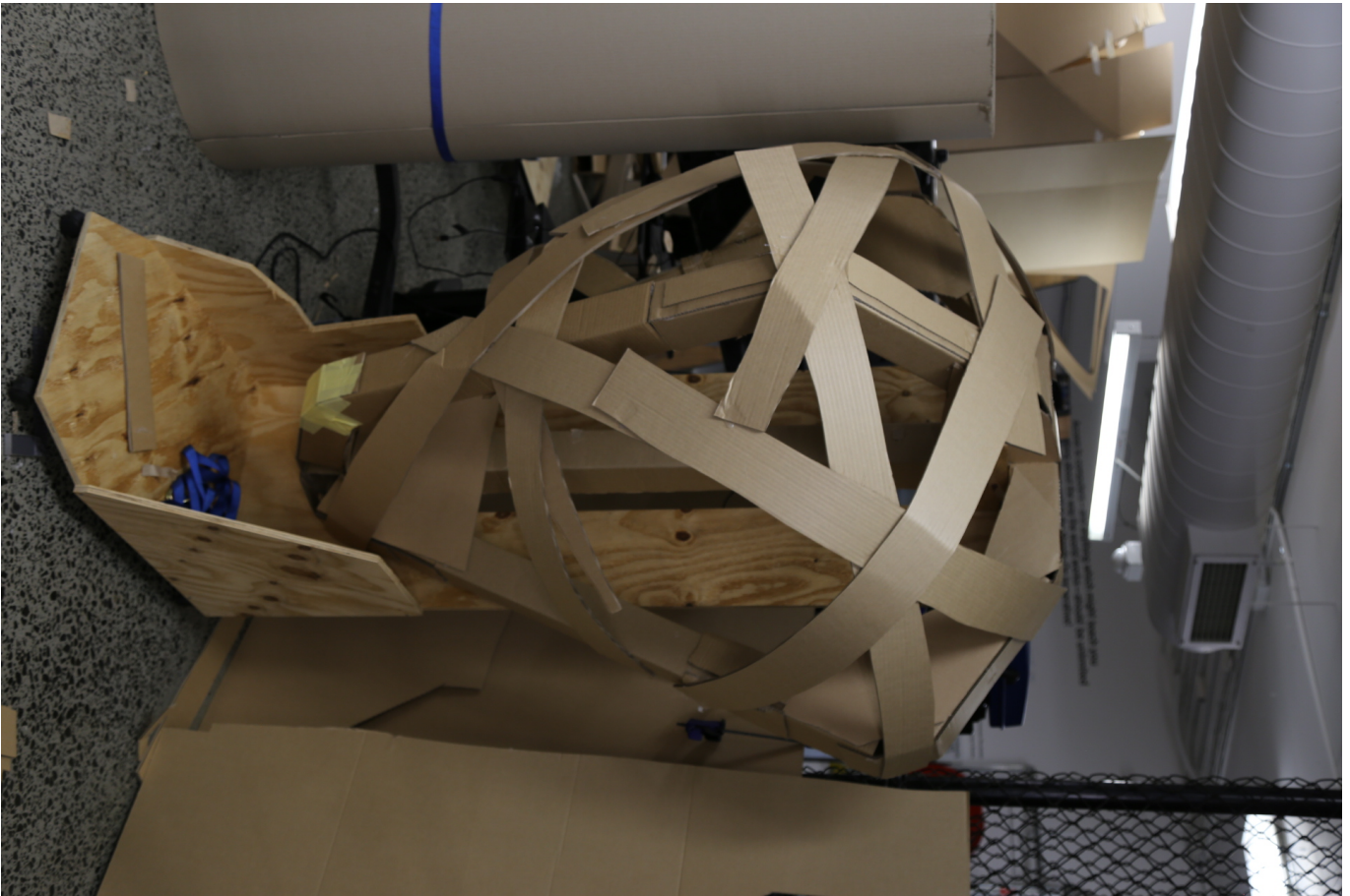
10 -20 sept