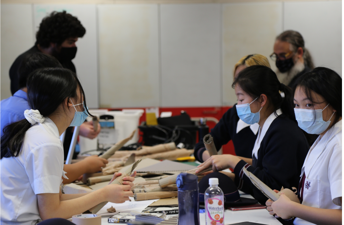
* Eye Fabrication