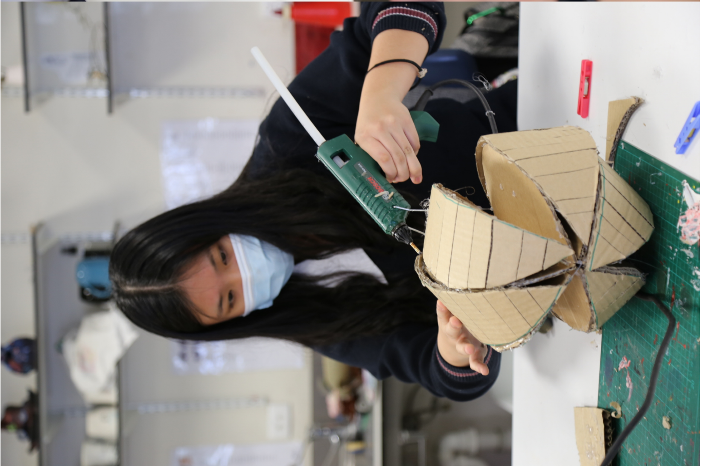
* Scale prep