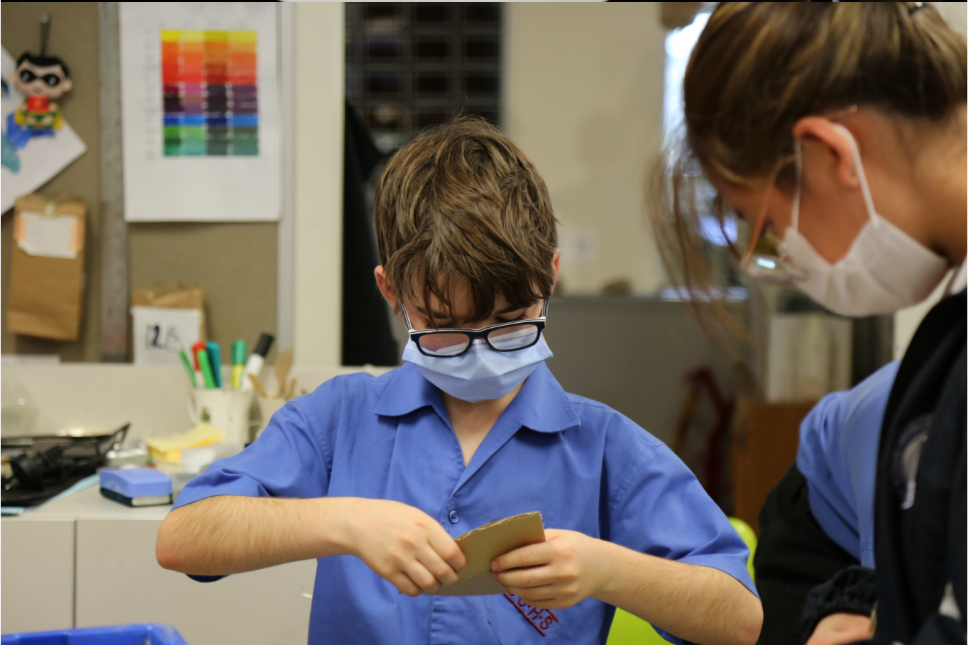
* Scale application