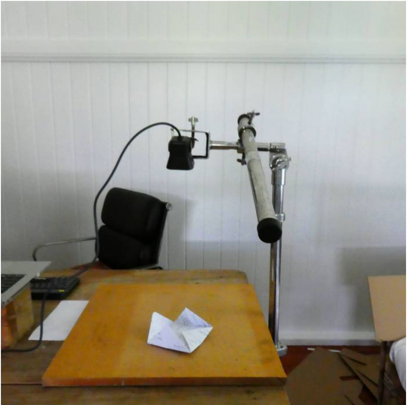
Drum kit stand re-purposed as webcam mount for top-down view