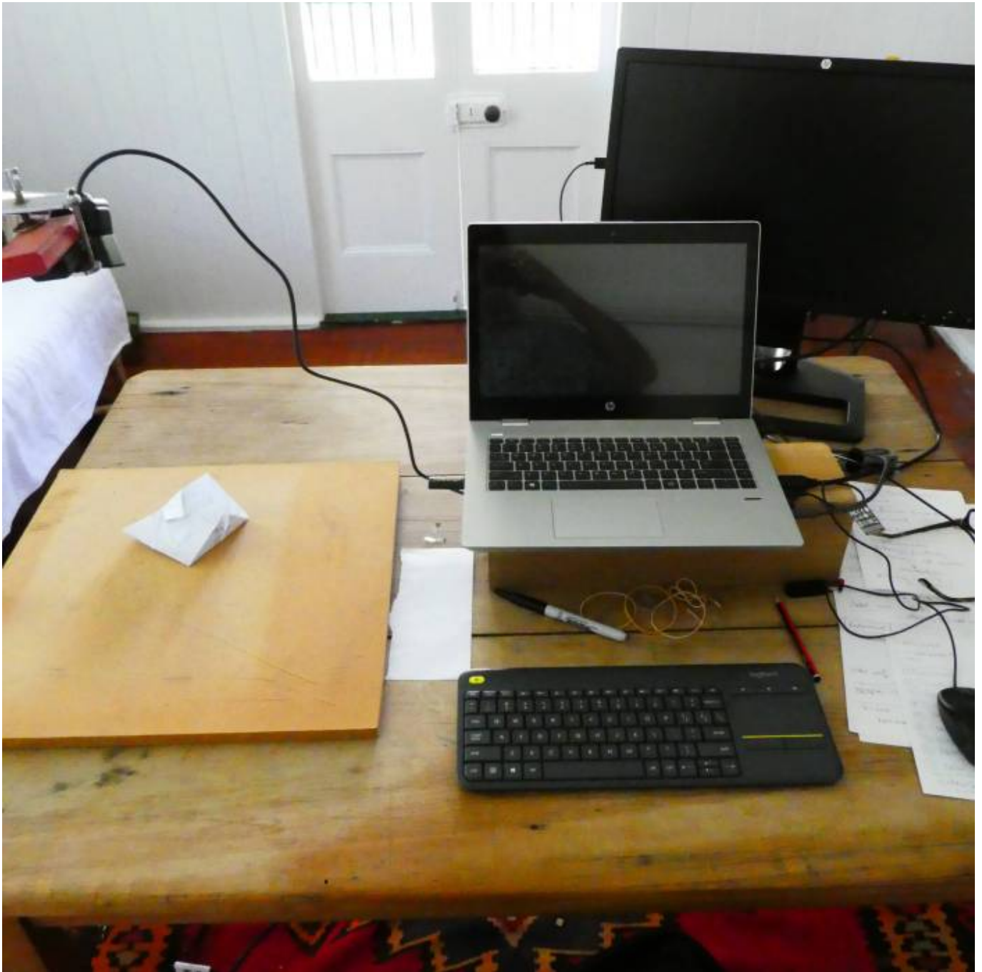
All stages accessible without moving from a seat.