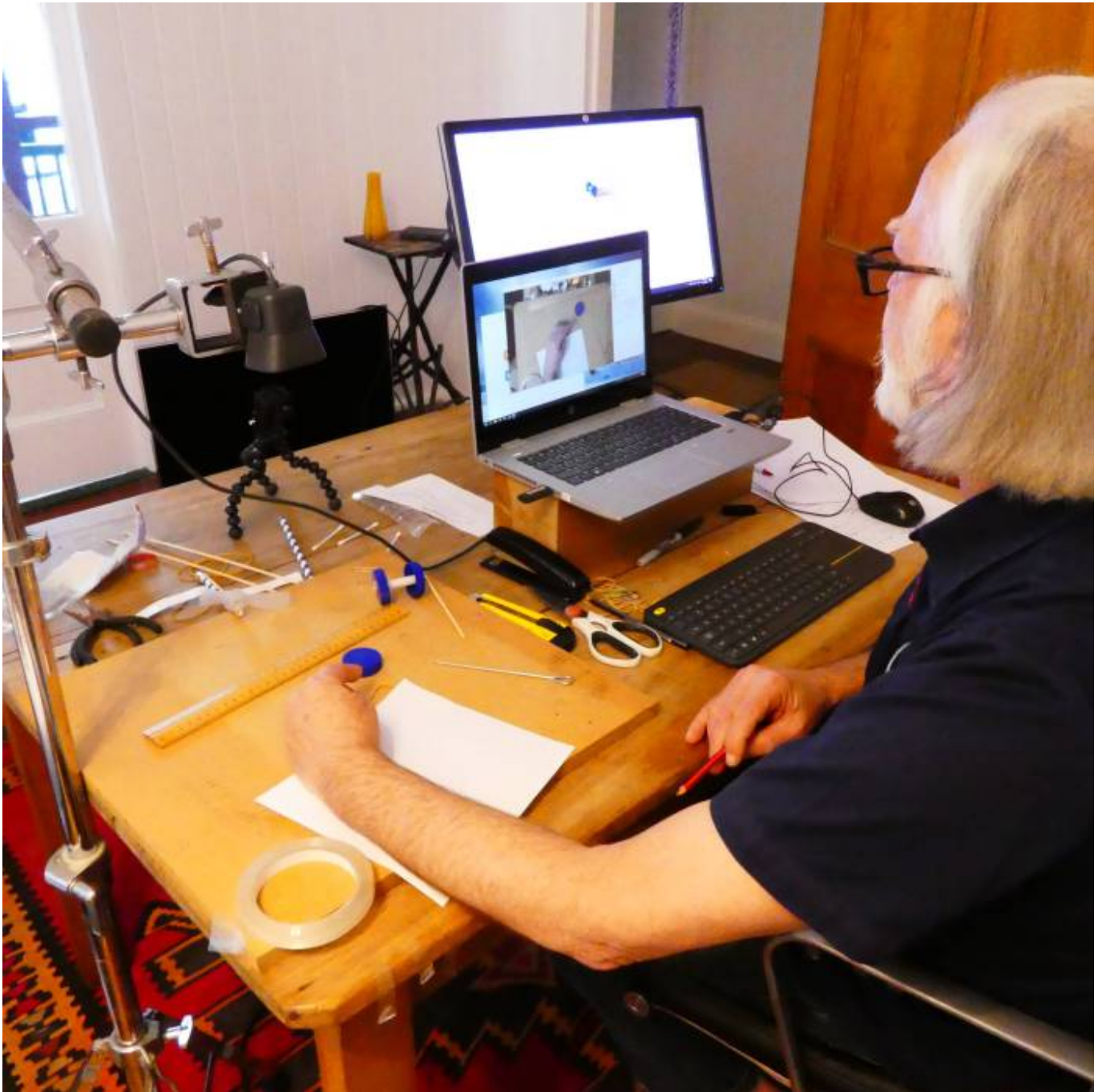
In action during a live remote workshop (note webcam view on laptop)